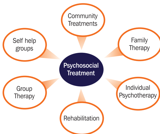
Figure Psychosocial treatments for people with schizophrenia that might reduce suicidality:

From a psychosocial perspective, clinicians should acknowledge patient's despair, discuss losses and daily difficulties and try to help establish new and accessible goals. Social isolation and work impairment are frequently reported as risk factors for suicide. Comprehensive psychosocial interventions should be routinely available to all people with schizophrenia and their families; and provided by appropriately trained mental health professionals with time to devote to the task. Psychosocial treatments that are advocated in managing people with schizophrenia and which might help reduce suicidality in this patient group are depicted in the Figure below.